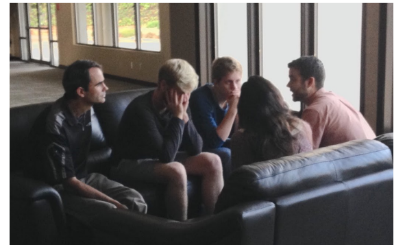
YWAM Discipleship School, Honolulu, HI

It has helped me understand my authority. It has increased my confidence to pray for others.