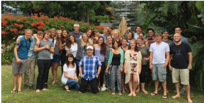
YWAM Discipleship School, Honolulu, HI

(for the 21st consecutive year). Because several of the staff there have been equipped in this way over the years, we are now able to take a smaller team when we go. There were 3 of us who went from Kingdom Ministries for this recent week-long teaching, training, and ministry school. Over the years, the title given for the week we're assigned has changed from Spiritual Warfare to Spiritual Authority or Freedom Week . The change is welcome and better describes the focus of our time in teaching and ministry there. Our purpose is to help students understand Jesus' central message